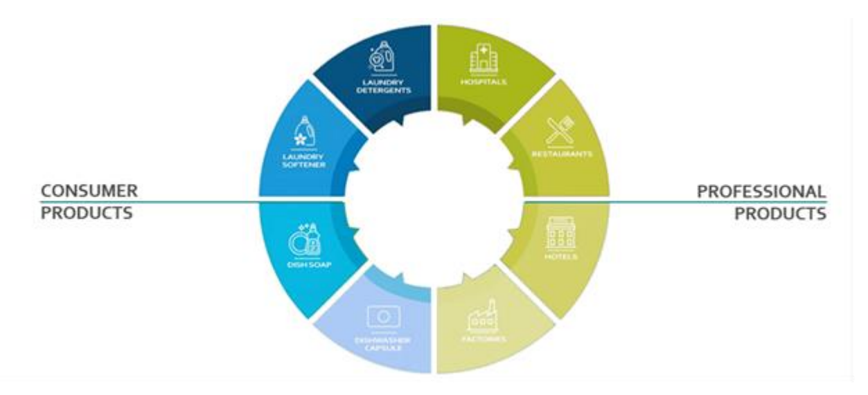
Figure 2 – Overview of consumer and professional detergents

In terms of total consumption, household products represent approximately 80% of all purchases with the professional sector accounting for the remaining 20%. An increase in total expenditure was observed in 2020 due to the COVID-19 pandemic that placed the focus on the importance of cleanliness and hygiene.