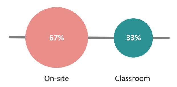
The St. Nicholas's Church Training Programme was opened to applicants that had qualified in a construction trade and/or had completed a course in traditional stonework skills (FETAC level 4 or VEC /ETB). Applicants were shortlisted and interviewed by the private sector contractor delivering the conservation project, in collaboration with Kilkenny County Council (conservation officer), and