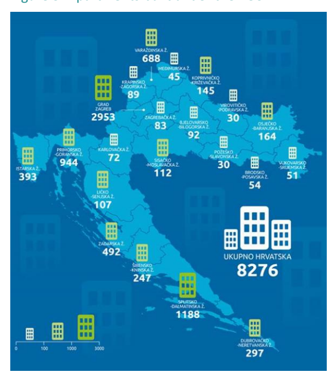
Figure 3: Apartments built under the POS

As shown in Figure 3, the POS has supported the construction of buildings and apartments across the whole country.