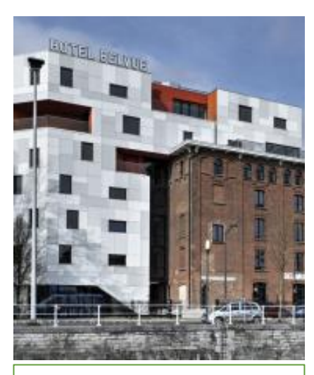
Tourism training centre and hotel (Brussels, Belgium)