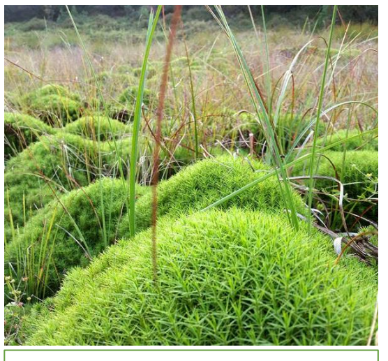
Sustainable cross-border peatland tourism