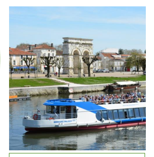
Electro-solar river boat (Saintes, France)