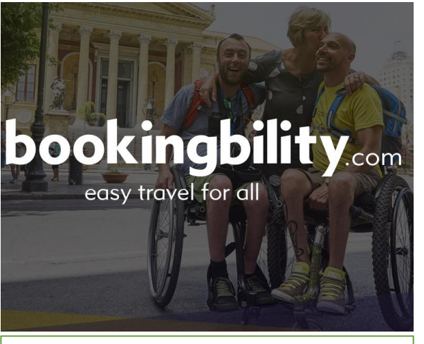
Accessible Accommodation Portal