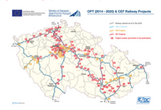
Figure 2: Geographical reach of planned interventions

Source: Planned Czech Republic Railway Infrastructure Projects Financed by the European Union between 2014 and 2020^{\rm 14}