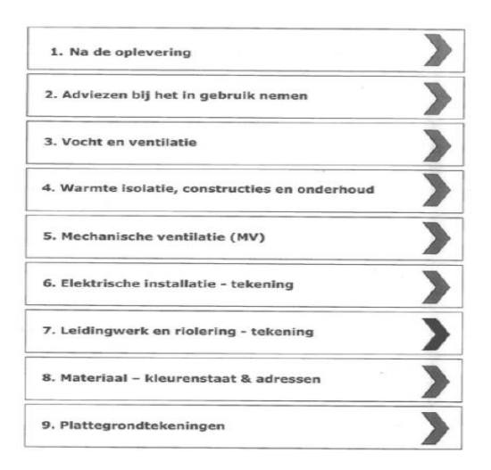
Figure 2: Opleverdossier (As-Built File) – existing contents

Looking forward, the qualitative study <sup>16</sup> commissioned by the Ministerie van Binnenlandse Zaken en Koninkrijksrelaties (Ministry of Internal Affairs) recommends that the Opleverdossier should contain the following required (R) and desirable (D) contents: