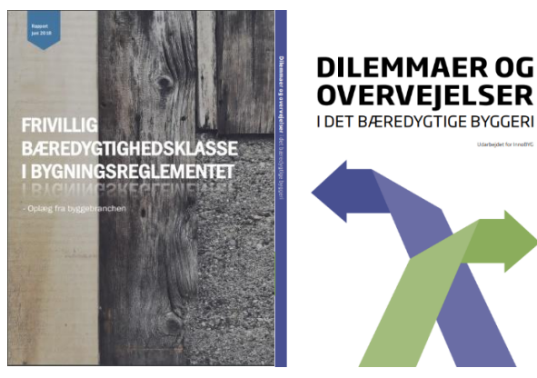
Figure 1: Examples of publications