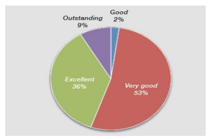
Figure 2: Breakdown of performance levels for the NF HQE® certification