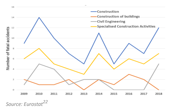
Figure 1: Number of fatal accidents in construction in Sweden

Although the Vision Zero Programme has not met its overall goal, Sweden consistently performs much better than the EU-27 average on two related indicators – the number of fatal accidents in construction and the number of accidents in construction in relation to the number of persons employed<sup>23</sup>.