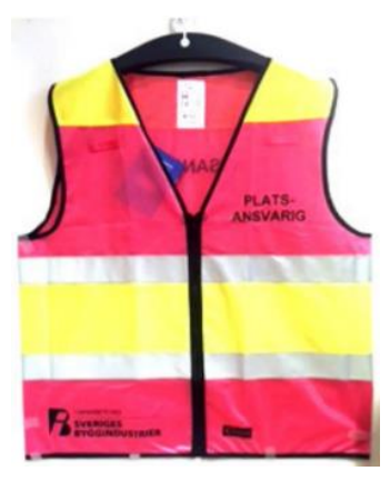
Figure 4: Warning vest for site managers