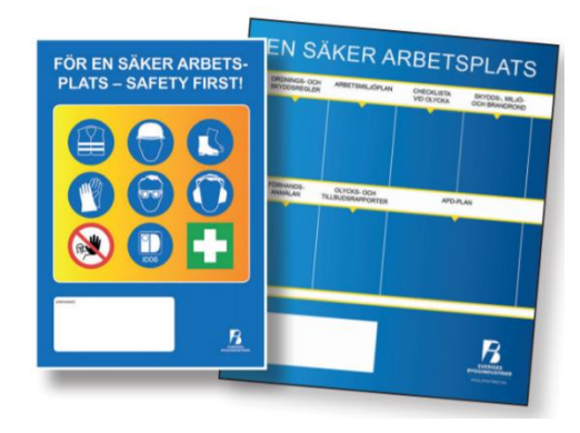
Figure 3: Signage models for construction sites