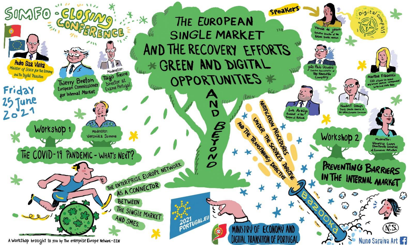
A Workshop brought to you by The enterprise Europe Network - EEN